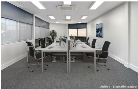
Suite 1 - Digitally staged