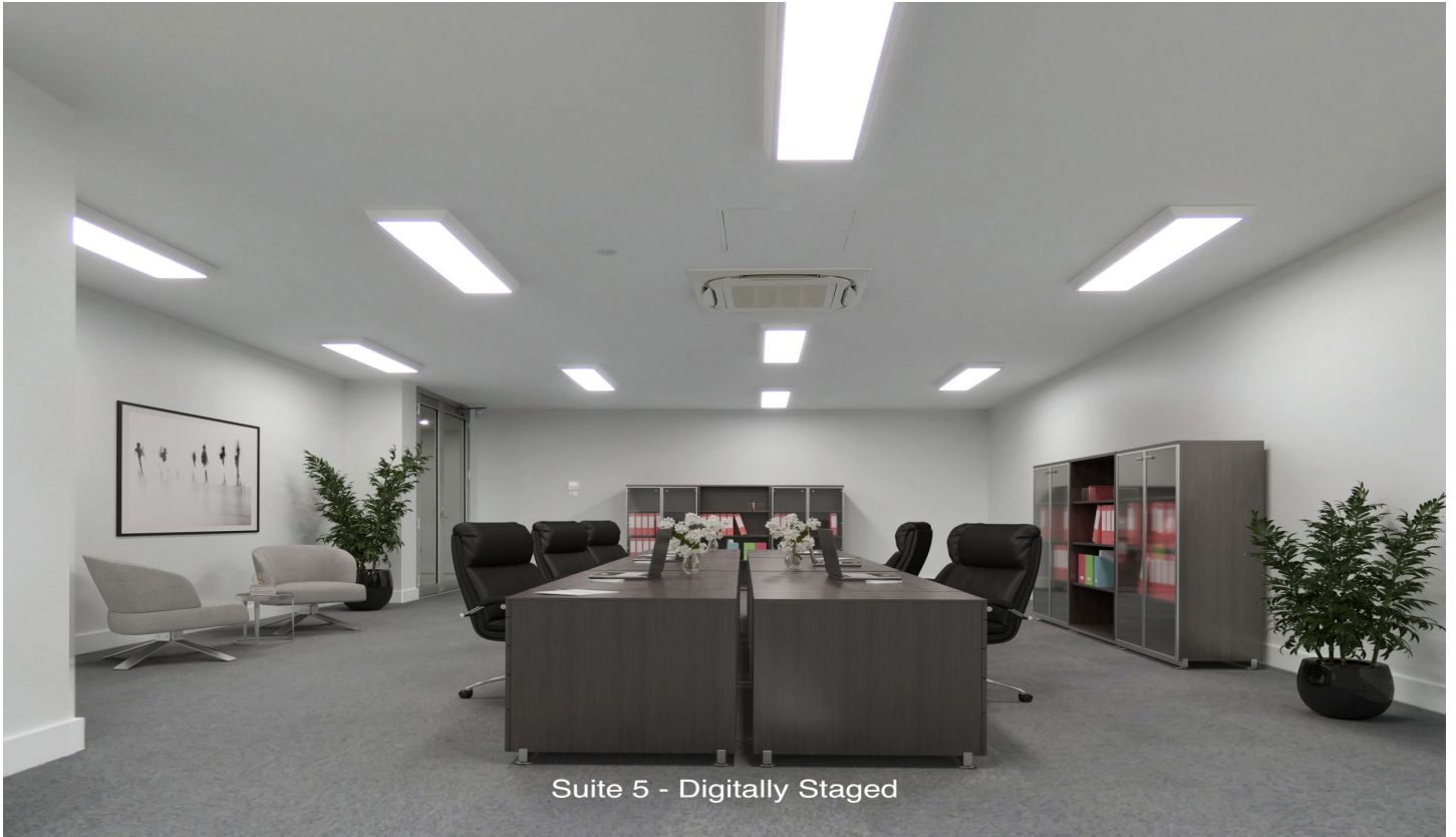
Suite 5 - Digitally Staged